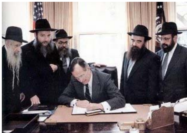
President George H. W. Bush (1989-1993)